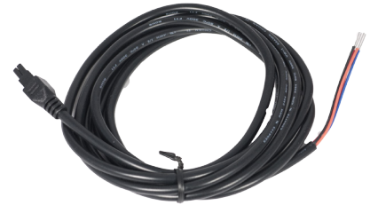
Part Number: 170585-000 MSRP: $14.49

Output Pin – The Output Pin can be used to allow an external device to read either whether the router is running or whether the modem is connected. Select one of the following options from the dropdown menu: